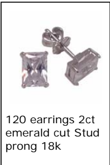
120 earrings 2ct emerald cut Stud prong 18k

Eleanor wore emerald cut stud prong earrings during the day session.