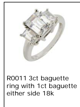
R0011 3ct baguette ring with 1ct baguette either side 18k