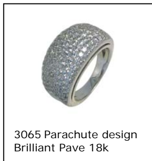
3065 Parachute design Brilliant Pave 18k