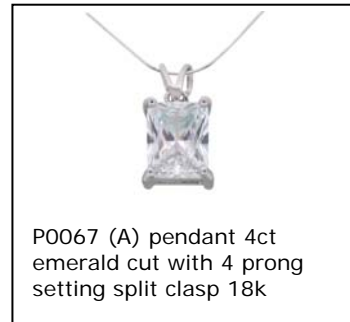
P0067 (A) pendant 4ct emerald cut with 4 prong setting split clasp 18k